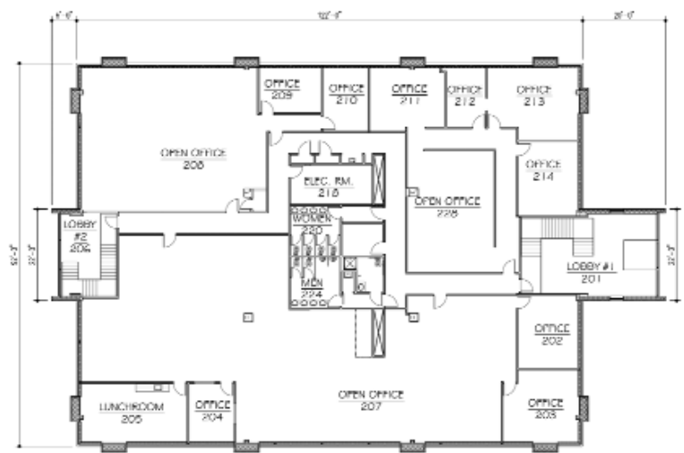
SECOND FLOOR 11,225 SF