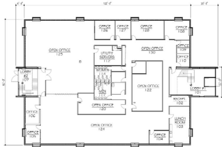
FIRST FLOOR 11,778 SF